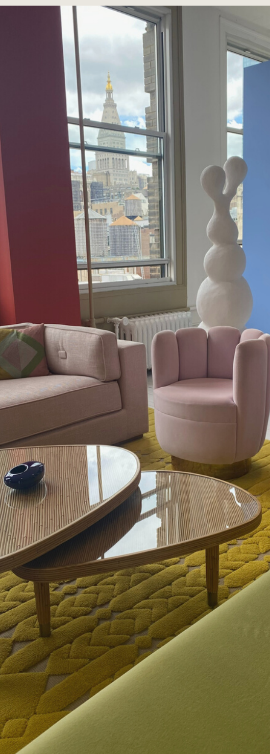
Table and chair legs, sometimes an afterthought, are now making a statement, adding an almost-hidden layer of visual interest to these pieces. NYC showcased quirky, fun and creative legs for tables, chairs and more!